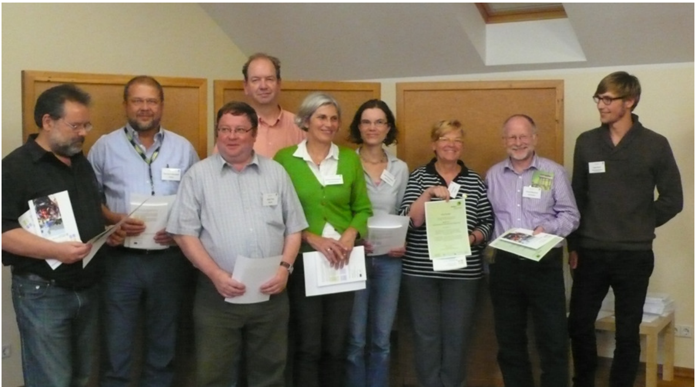
“Certificates for Michendorf and neighbouring cities”

Intentions of the participants from Michendorf after the course were to push the process of systematic energy action planning and to improve stakeholder involvement including citizens and the local agenda 21 actors. Already during the course the participants put the issue of climate and energy planning on the agenda of the municipal council. On Mar. 19 th 2012 the majority of the council voted for Michendorf committing to the green-house gas reduction targets of the federal German government and strengthened the intention to set up a climate and energy plan in 2013. To involve further stakeholders and to prepare this plan a series of events on climate and energy perspectives in Michendorf was started on Apr. 23 rd 2012.