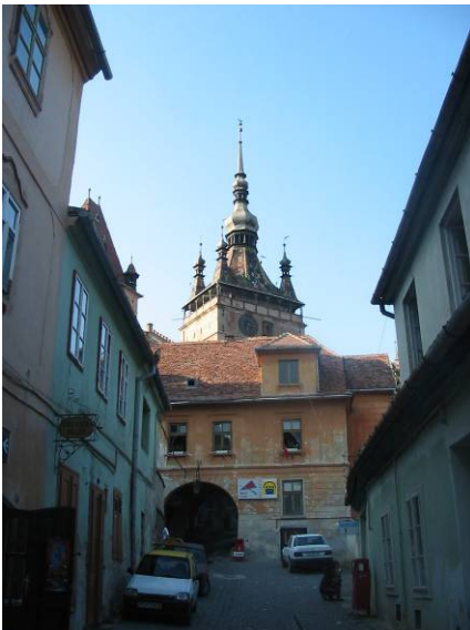
Sighisoara, Tower in the fortress

During the project time the Municipality of Sighisoara signed the Covenant of Mayors and expressed the intention to elaborate SEAP, and to implement climate protection projects. They have intention to became energy producers, the problem is that they face problems to sell energy to the network (unfortunately this is a general problem in Romania, the small energy suppliers have problems to sell energy to the network, because of the administrative burdens and because of the lack of interest in this issue from the the owner of the distribution network)