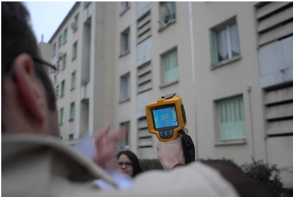
Infra-red thermography campaign in St Priest

In July, the City of SAINT PRIEST confirmed to the Greater Lyon that a CAP is planned to be approved at the end of 2013.