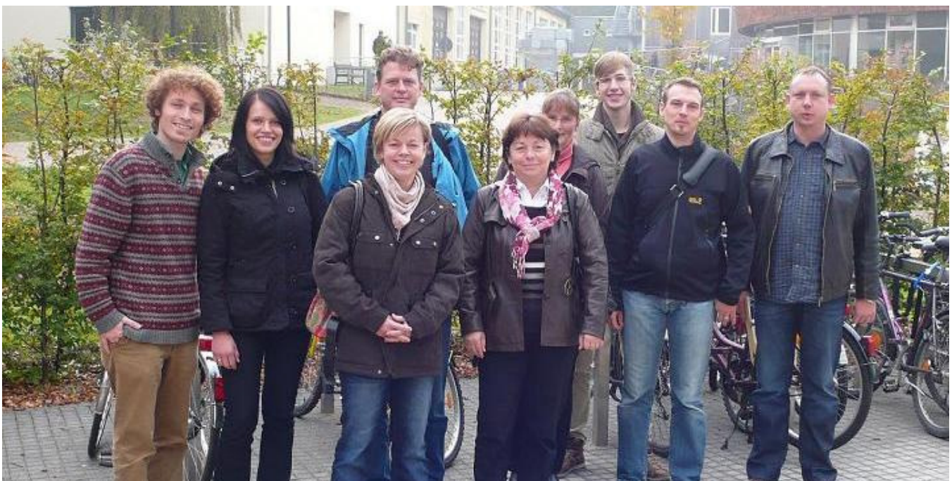
Staff course on climate city walk

Intentions of Eberswalde after the course were to set up an internal energy working group focussing on the following fields of action: Use of Renewables, building sector, street lightening, traffic, collective heating system, internal processes. Furthermore it was intended to involve further stakeholders and to set up a municipal energy action plan. The idea of setting up a SEAP was first presented in the municipal council on Feb. 7 th 2012, on Apr. 20 th 2012 the council decided on the development of an municipal energy concept till May 2013. Flanking this activities a round table was set up to involve further stakeholders, which had its first session on Jun. 6 th 2012 (1. Klimatisch Eberwalde).