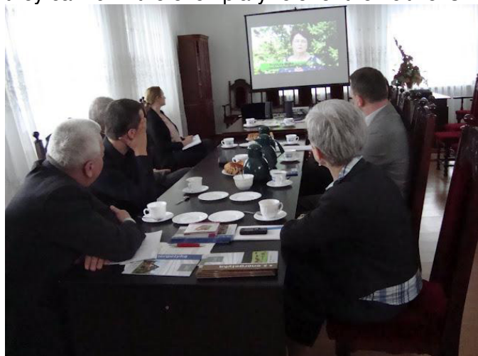
On-site seminar in Małkinia Górna

The course participants agreed there was too short time to implement all ideas invented during BEAM 21 project. They plan then to further discuss and put them into practise in the nearest future so that they can fulfil the exemplary role for their citizens.