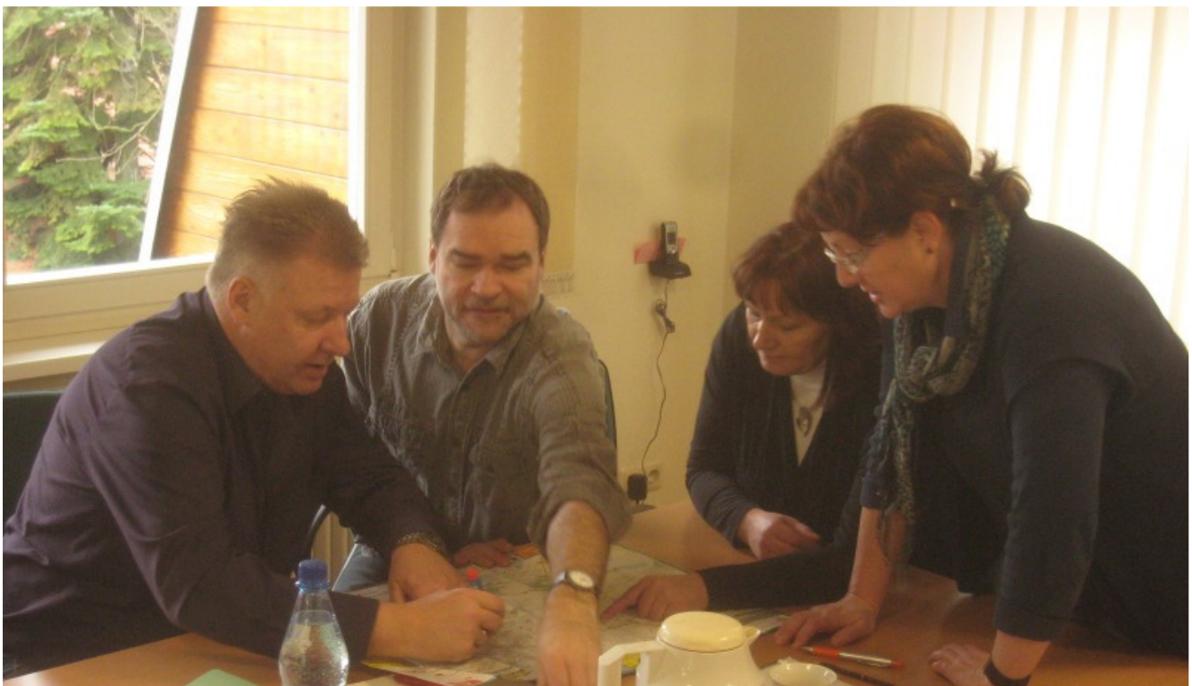
“Discussion among staff Luebbenau”

Intentions after the course have been to expand wind power and solar power plants on waste land, so start a solar cataster and a funding programm to facilitate private run solar power plants. Energetic renovation of public buildings shall be finished and user shall be educated, building permissions shall take a closer look at insulation, bike traffic lanes be further developed. Car free zones in the old town of Luebbenau were considered as well as green procurement measures for the fleet. Furthermore involvement of citizens in energy planning was intended to be increased by e.g. a round climate table and climate protection workshops. Especially the participants of the staff course were very enthusiastic after the end of the course. Compared to this actual results at the end of the project are rather week.