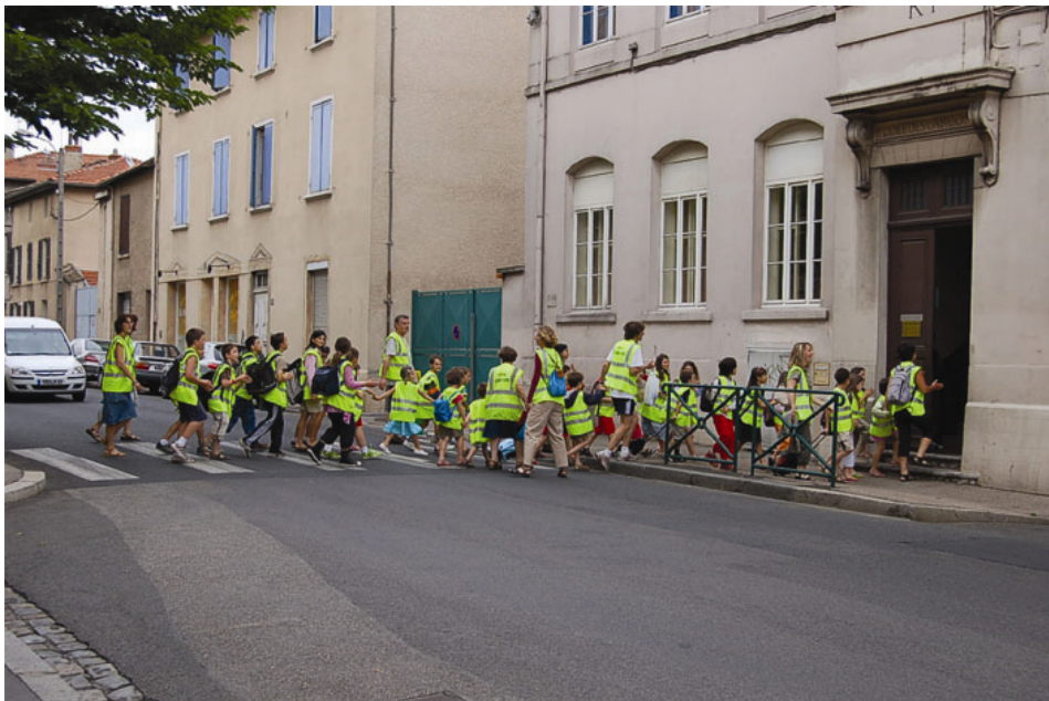
Pedibus - School of caluire

The City of CALUIRE doesn't plan to build and approve a CAP soon but is fond of exchanges about energy with other cities of the Greater Lyon.