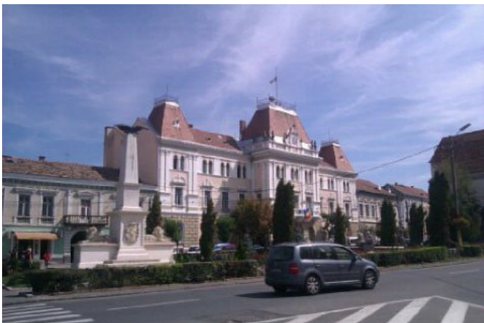
Odorheiu Secuiesc: Town Hall.

According to the discussions after the training the people from Odorheiu Secuiesc show optimism concerning the implementation of climate protection measures, they are satisfied to be member of BEAM21 network and to work together with other municipalities in climate protection measures. They intend firstly to sign the Covenant of Mayors, to elaborate the SEAP and to introduce measures concerning the renewable energy production, building renovation and sustainable transport