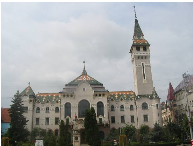
The town hall in Tg. Mures

The course gave an impulse and a motivation to the municipality to elaborate the SEAP. Several people understood better how is working the Covenant of Mayors and the implementation of SEAP. The main areas of intervention for the further projects look to be: use of the solar energy and biomass, isolation of the buildings, public lighting, and improvements in traffic. At this moment the municipality is working on the elaboration of SEAP.