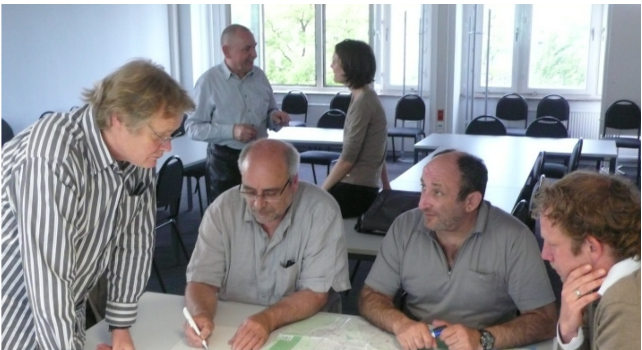
“Group work decision maker course Potsdam”

There were three major intentions after the course: to integrate energy aspects much stronger into urban planning, to strengthen the city's climate council by involving more management level staff as well as to generally improve stakeholder involvement and to initiate decision on Covenant of Mayors membership. Results of the course were e.g. intensified discussions in the city council on. In the city council inquiries have been launched by course members on climate friendly fleet, energy aspects in urban development projects running and spatial planning. Discussions took place about paperless procedures in the administration, energy saving potentials of LED technology in traffic sector and the integration of RES in city-planning competitions. On May 2 nd 2012 the city council decided to engage the municipal energy service company to develop an implementation concept to achieve a renewable share in energy mix of the city of 100% till 2050. Regarding improved stakeholder involvement. To improve stakeholder involvement in July 2012 an initiative has been started to found a Potsdam climate alliance, involving local economy and civil society.