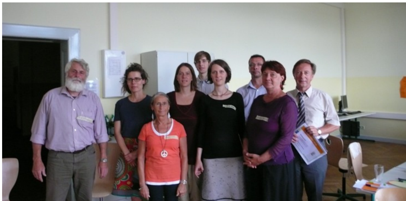
Greeting of the vice-mayor of Rathenow, foto: Heinrich-Boell-Stiftung Brandenburg

At the end of the course, ideas of the participants for further local action were touching a wide range of action fields: solar run street lightening, central server system in the administration, climate friendly fleet, density of the inner city as priority, municipal info campaign, developing public transport as well in touristic context, energy consultation service for citizens. Generally the added value of a structured sustainable energy action plan was recognized. As result on Apr. 4 th 2012 the municipal council Rathenow decided to develop a climate and energy action plan with great cross-party majority.