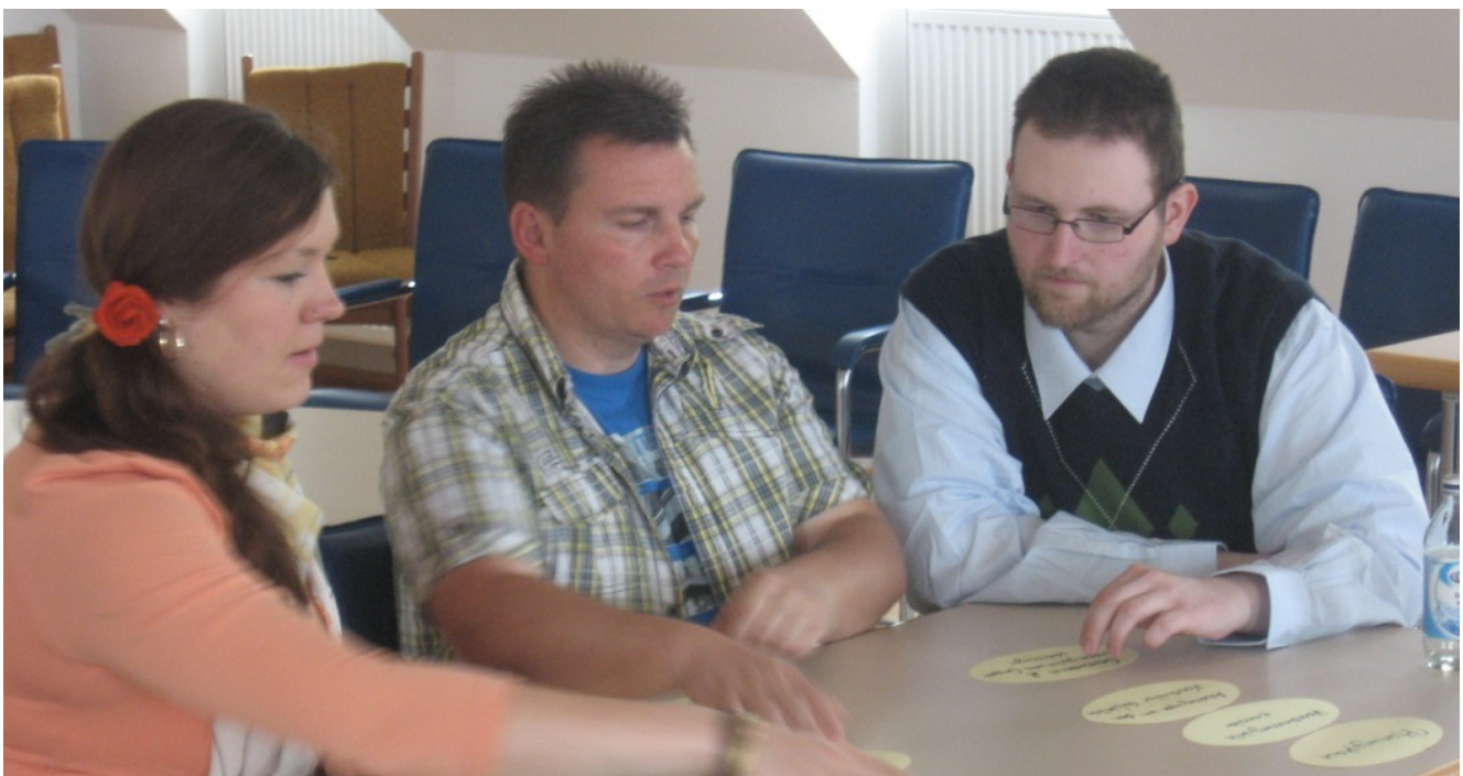
“Group work Teltow”, foto: Heinrich-Boell-Stiftung Brandenburg

Intentions after the course mainly were to speed up implementation process of the climate action plan. Concretely intentions are the improvement of energy consultation for citizens, the introduction of green public procurement measures, building renovation according to passive house standard, introduction on energy criteria in spatial planning and traffic planning and the set up of a RES land use registry. Result of the course is mainly that among municipal staff and decision makers the implementation of the climate action plan is more visible on the agenda. For example on initiative of BEAM 21 course members there was a discussion and presentation on stage of implementation in the municipal council of Teltow on Jun. 20 th 2012. Same is planned for Kleinmachnow for September 2012.