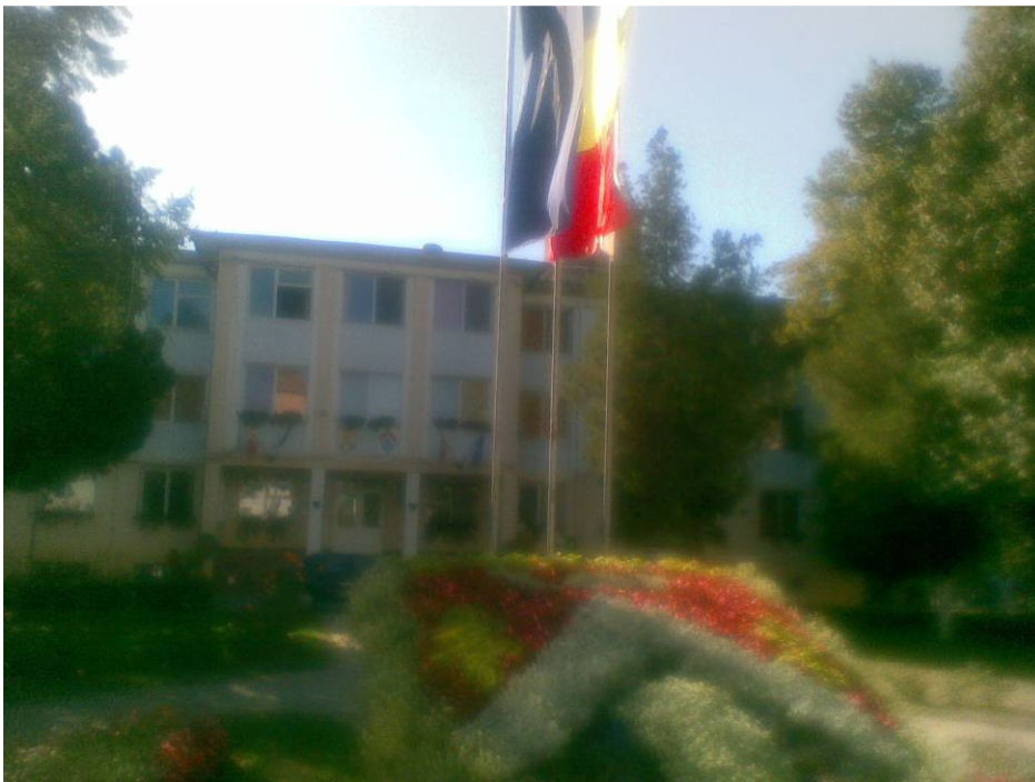
Town hall of Ludus, photo: Zoltan Hajdu

According to the discussions with the participants on the training, the town received an important input concerning the energy and climate protection issue by the project BEAM21 and they intend to elaborate a SEAP but the further developments depend also on the economical, political situation.