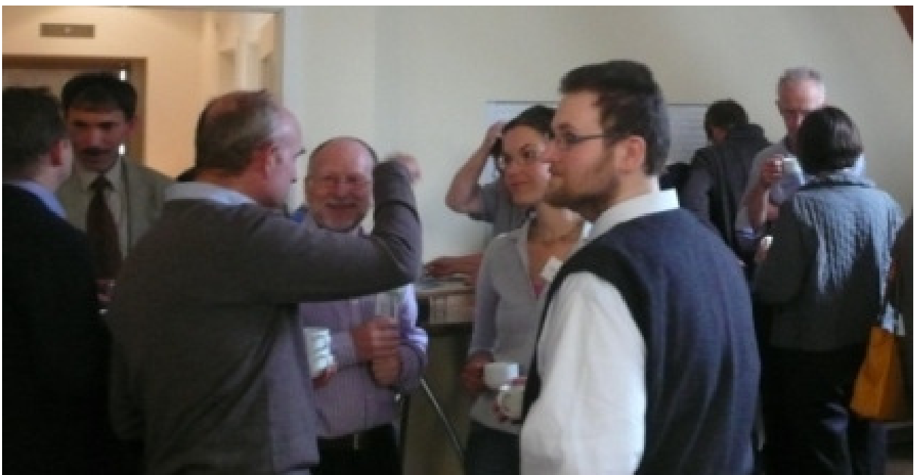
“Networking of participants on final conference”, foto: Heinrich-Boell-Stiftung Brandenburg

After the beginning of the course the municipality of Nuthetal took general climate decision. According to this CO2 emissions shall be reduced by 20% till 2020 compared to 2005 (base line year) and a climate action plan will be set up. Intentions after the course where to strengthen and support the implementation of the climate targets. On May 16 th 2012 the kick-off workshop with municipal stakeholders took place to work out main action fields for the climate action plan. Discussion will be continues in working groups.