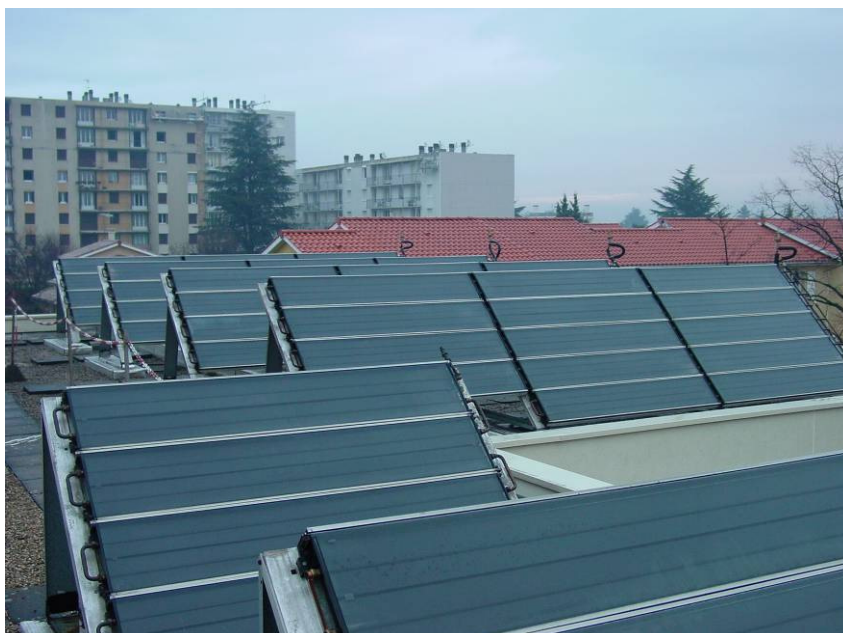
Hot water production on the roof of the central kitchen of Meyzieu (C) ALE.

The City of MEYZIEU doesn't plan to build and approve a CAP in 2012 or 2013.