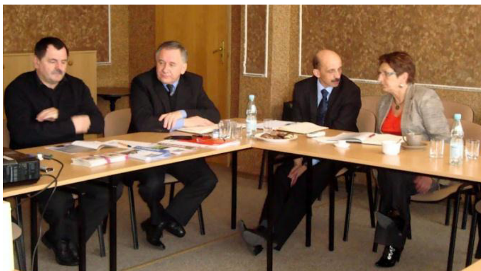
On-site seminar in Rejowiec Fabryczny

As a result of BEAM 21 project Rejowiec Fabryczny authorities consider development of SEAP. Some steps in this field have already been made, i.e. distribution of info materials among inhabitants.