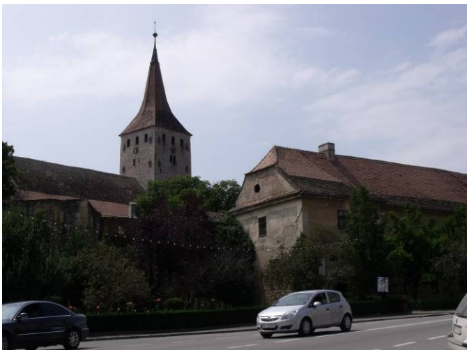
Aiud, church in the fortress, photo: Zoltan Hajdu

According to the discussion with the participants, and according to the declaration made by the mayor of the town at the end of the course, the BEAM21 project fit very well to the intentions of the town and offered an important support for realisation of their goals.