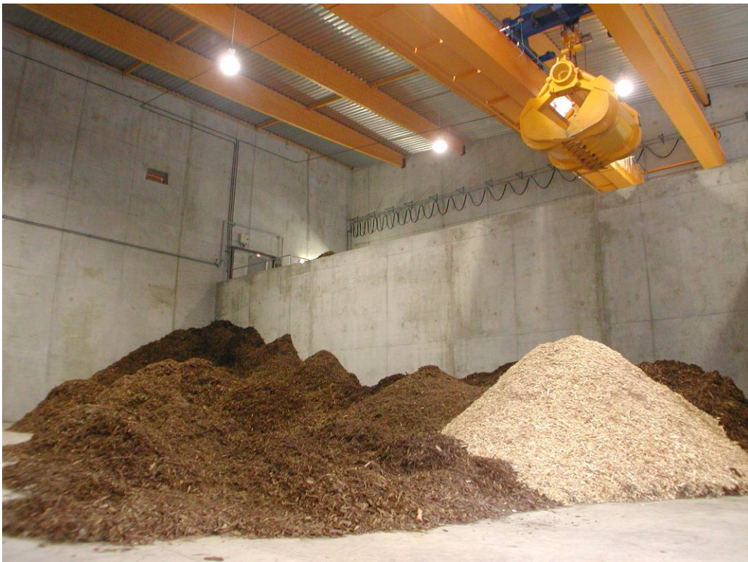
Chaufferie bois Venissieux

VENISSIEUX has the project to obtain for the European Energy Awards. A consultant will prepare the survey and the appliance document from april to oct 2013.