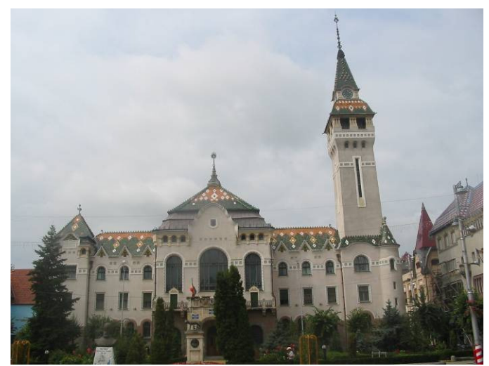
The town hall in Tg. Mures

The course gave an impulse and a motivation to the municipality to elaborate the SEAP. Several people understood better how is working the Covenant of Mayors and the implementation of SEAP. The main areas of intervention for the further projects look to be: use of the solar energy and biomass, isolation of the buildings, public lighting, and improvements in traffic. At this moment the municipality is working on the elaboration of SEAP.