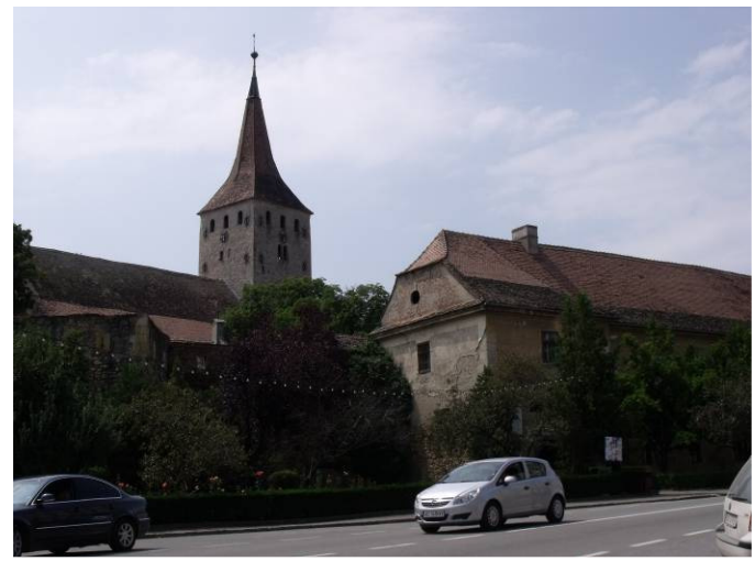
Aiud, church in the fortress, photo: Zoltan Hajdu

According to the discussion with the participants, and according to the declaration made by the mayor of the town at the end of the course, the BEAM21 project fit very well to the intentions of the town and offered an important support for realisation of their goals.