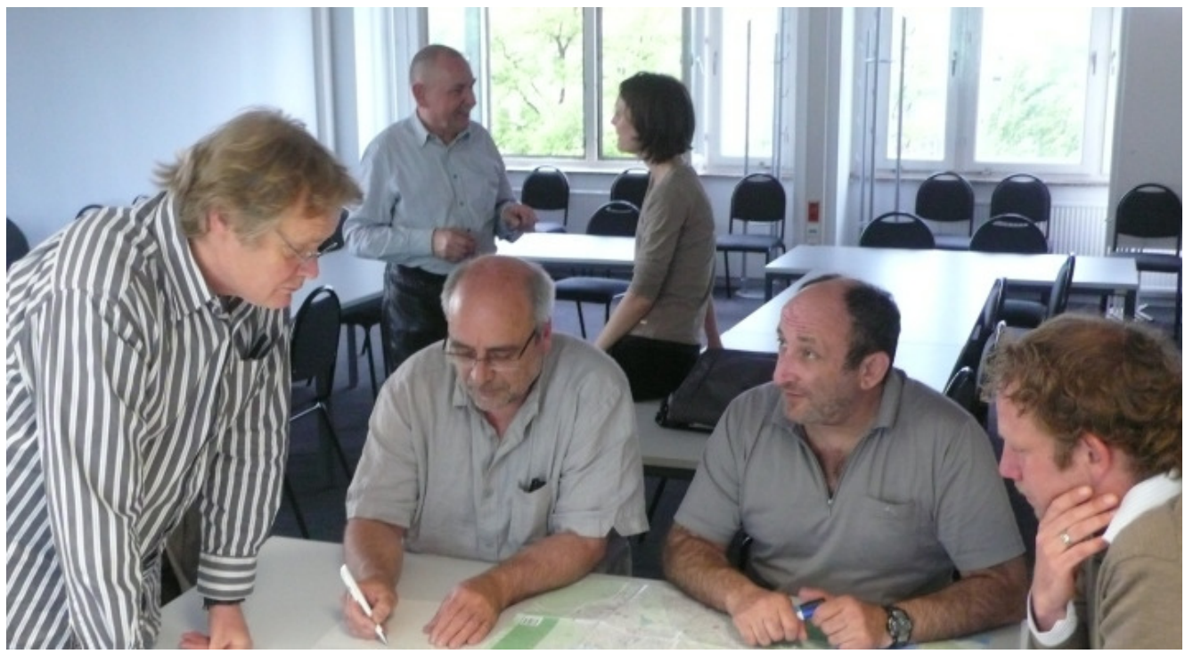
"Group work decision maker course Potsdam"

There were three major intentions after the course: to integrate energy aspects much stronger into urban planning, to strengthen the city's climate council by involving more management level staff as well as to generally improve stakeholder involvement and to initiate decision on Covenant of Mayors membership. Results of the course were e.g. intensified discussions in the city council on. In the city council inquiries have been launched by course members on climate friendly fleet, energy aspects in urban development projects running and spatial planning. Discussions took place about paperless procedures in the administration, energy saving potentials of LED technology in traffic sector and the integration of RES in city-planning competitions. On May 2<sup>nd</sup> 2012 the city council decided to engage the municipal energy service company to develop an implementation concept to achieve a renewable share in energy mix of the city of 100% till 2050. Regarding improved stakeholder involvement. To improve stakeholder involvement in July 2012 an initiative has been started to found a Potsdam climate alliance, involving local economy and civil society.