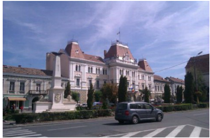
Odorheiu Secuiesc: Town Hall.

According to the discussions after the training the people from Odorheiu Secuiesc show optimism concerning the implementation of climate protection measures, they are satisfied to be member of BEAM21 network and to work together with other municipalities in climate protection measures. They intend firstly to sign the Covenant of Mayors, to elaborate the SEAP and to introduce measures concerning the renewable energy production, building renovation and sustainable transport