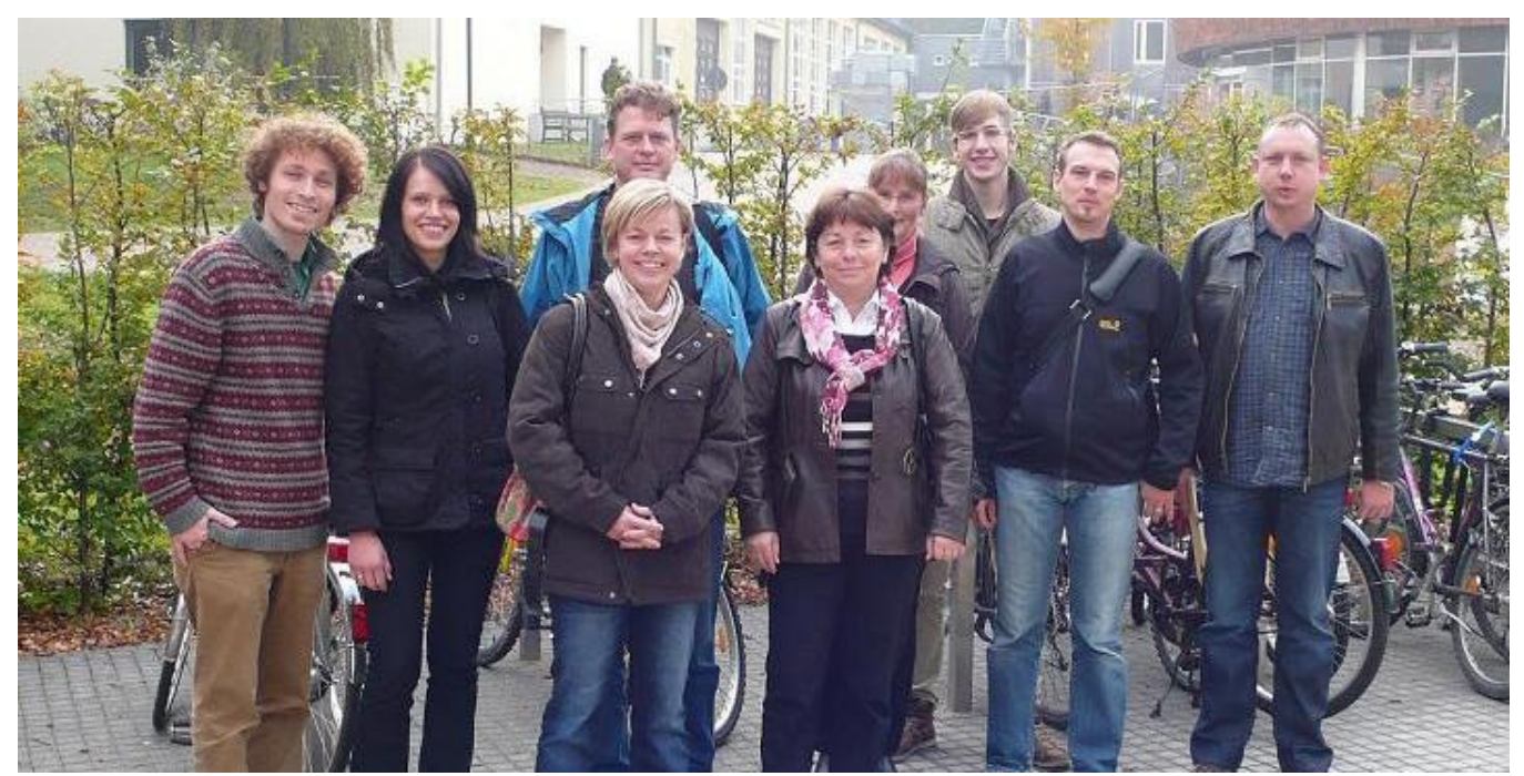
Staff course on climate city walk, foto: Heinrich-Boell-Stiftung Brandenburg

Intentions of Eberswalde after the course were to set up an internal energy working group focussing on the following fields of action: Use of Renewables, building sector, street lightening, traffic, collective heating system, internal processes. Furthermore it was intended to involve further stakeholders and to set up a municipal energy action plan. The idea of setting up a SEAP was first presented in the municipal council on Feb. 7<sup>th</sup> 2012, on Apr. 20<sup>th</sup> 2012 the council decided on the development of an municipal energy concept till May 2013. Flanking this activities a round table was set up to involve further stakeholders, which had its first session on Jun. 6<sup>th</sup> 2012 (1. Klimatisch Eberwalde).