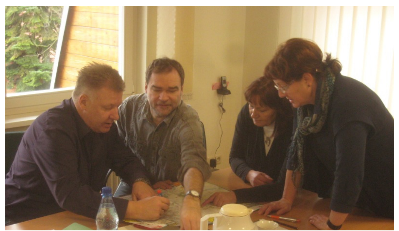
"Discussion among staff Luebbenau", foto: Heinrich-Boell-Stiftung Brandenburg

Intentions after the course have been to expand wind power and solar power plants on waste land, so start a solar cataster and a funding programm to facilitate private run solar power plants. Energetic renovation of public buildings shall be finished and user shall be educated, building permissions shall take a closer look at insulation, bike traffic lanes be further developed. Car free zones in the old town of Luebbenau were considered as well as green procurement measures for the fleet. Furthermore involvement of citizens in energy planning was intended to be increased by e.g. a round climate table and climate protection workshops. Especially the participants of the staff course were very enthusiastic after the end of the course. Compared to this actual results at the end of the project are rather week.