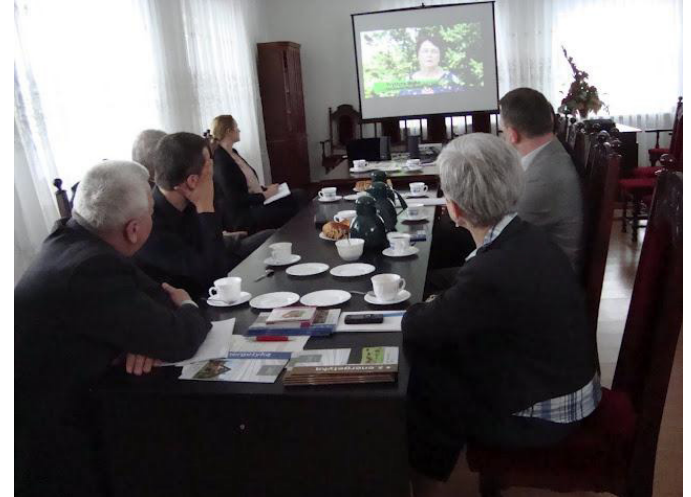
On-site seminar in Małkinia Górna

The course participants agreed there was too short time to implement all ideas invented during BEAM 21 project. They plan then to further discuss and put them into practise in the nearest future so that they can fullfil the exemplary role for their citizens.