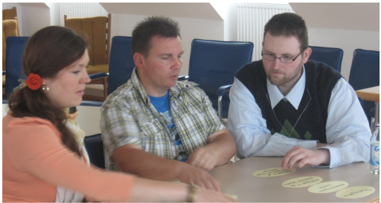
"Group work Teltow", foto: Heinrich-Boell-Stiftung Brandenburg

Intentions after the course mainly were to speed up implementation process of the climate action plan. Concretely intentions are the improvement of energy consultation for citizens, the introduction of green public procurement measures, building renovation according to passive house standard, introduction on energy criteria in spatial planning and traffic planning and the set up of a RES land use registry. Result of the course is mainly that among municipal staff and decision makers the implemention of the climate action plan is more visible on the agenda. For example on initiative of BEAM 21 course members there was a discussion and presentation on stage of implementation in the municipal council of Teltow on Jun. 20<sup>th</sup> 2012. Same is planned for Kleinmachnow for September 2012.