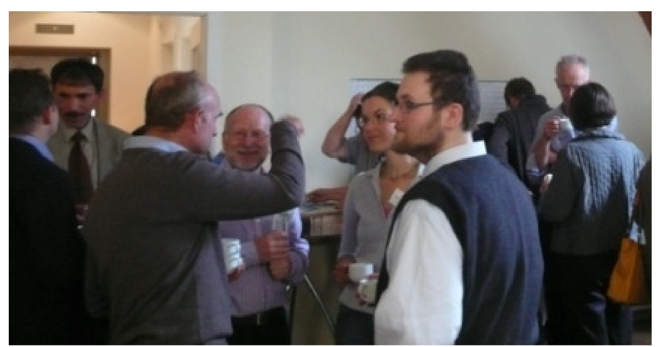
"Networking of participants on final conference"

After the beginning of the course the municipality of Nuthetal took general climate decision. According to this CO2 emissions shall be reduced by 20% till 2020 compared to 2005 (base line year) and a climate action plan will be set up. Intentions after the course where to strengthen and support the implementation of the climate targets. On May 16<sup>th</sup> 2012 the kick-off workshop with municipal stakeholders took place to work out main action fields for the climate action plan. Discussion will be continues in working groups.