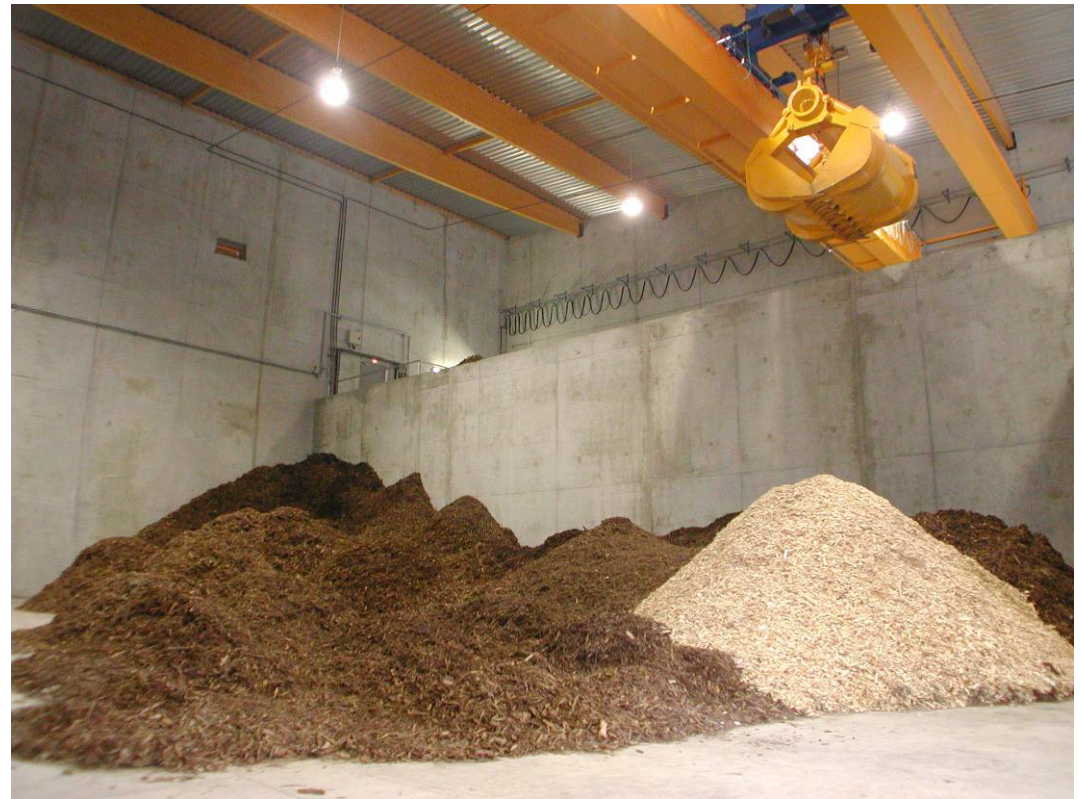
Chaufferie bois Venissieux

VENISSIEUX has the project to obtain for the European Energy Awards. A consultant will prepare the survey and the appliance document from april to oct 2013.