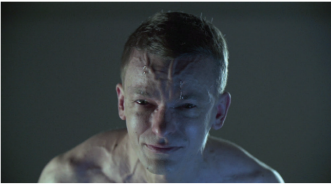
OSKAR DAWICKI, "TEARS OF JOY", 2014, 3'17", VIDEO STILL COURTESY AND © RASTER GALLERY, WARSAW

Dom umenia / Kunsthalle Bratislava (KHB) is a contemporary art gallery with no own collection that exhibits national and international visual art. The local mission of KHB is to make visual art accessible to the general public. In terms of its international aims, KHB focuses on highlighting Slovak visual art through systematic networking with major partner institutions abroad. KHB comprises Kunsthalle LAB – an exhibition space of a laboratory type – as well as Kunsthalle KLUB – a space devoted to education in the field of contemporary visual art by means of lectures, discussions and various presentations. KHB strives for making visual art approachable for a general public through a new experimental form of communication based on participation.