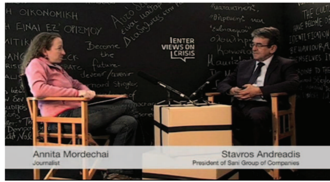
"ENTER VIEWS ON CRISIS - WORK IN PROGRESS", 2015, 4'30", VIDEO STILL COURTESY AND © ENTER VIEWS ON CRISIS

ArtBOX is dedicated to conceiving and implementing contemporary art projects in Greece and abroad. As artistic director and project manager, ArtBOX has been involved in all significant contemporary art events in Greece, and in many exhibitions abroad, such as the Venice Biennale. Together with the Goethe-Institut Thessaloniki , ArtBOX is currently co-organising the project Artecitiya , a partnership among 8 institutions from around Europe.