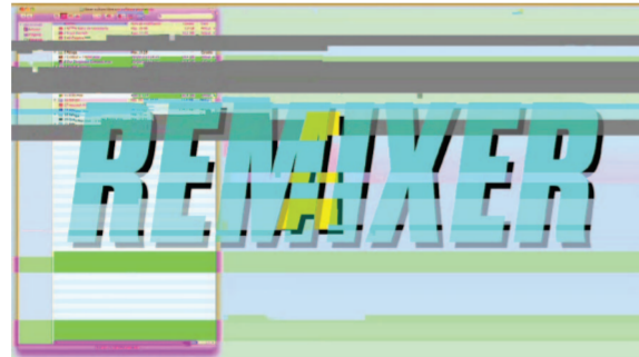
ZEMOS98, "EVERYONE CAN BE A REMIXER", 2013, 23', SPAIN / 2013. CC BY SA

ZEMOS98 is a social enterprise that works and investigates on new media art, free culture and social innovation. ZEMOS98 has organised the ZEMOS98 Festival for the last 17 years, an international reference on issues related to digital culture and experimental narratives. ZEMOS98 works on an international level and is the coordinator of the Doc Next Network , that conducted projects such as Remapping Europe (2012-14) as well as Radical Democracy (2014-15) . Its recent project is Macarena Lab , an independent school that directs to foster civic participation through new media art in Seville's' neighborhood Macarena. ZEMOS98 is also very active as investigator and as publisher of an online magazine ( www.embed.at ) and various books.